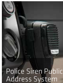
Police Siren Public Address System