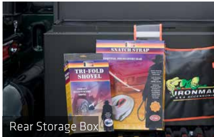
Rear Storage Box