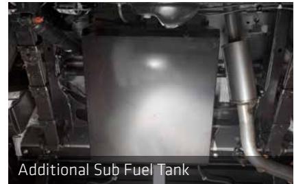
Additional Sub Fuel Tank