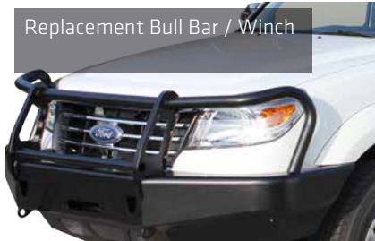
Replacement Bull Bar / Winch