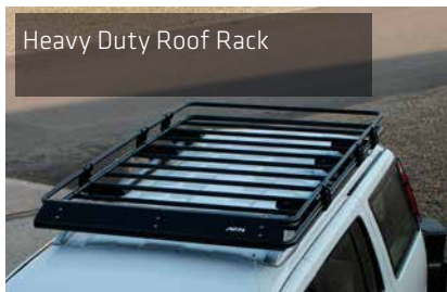
Heavy Duty Roof Rack