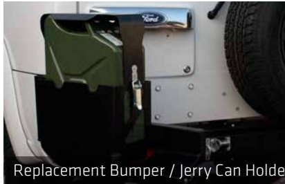
Replacement Bumper / Jerry Can Holder