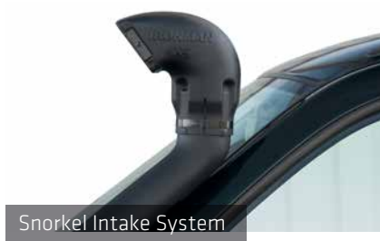
Snorkel Intake System