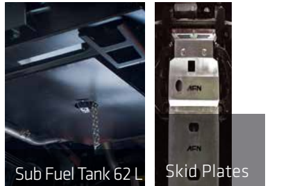
Sub Fuel Tank 62 L Skid Plates