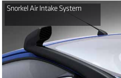
Snorkel Air Intake System