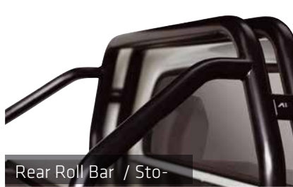
Rear Roll Bar / Stopping