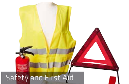
Safety and First Aid