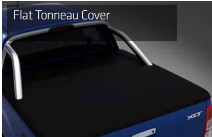
Flat Tonneau Cover