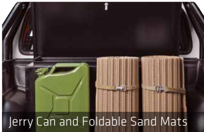
Jerry Can and Foldable Sand Mats