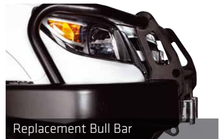
Replacement Bull Bar