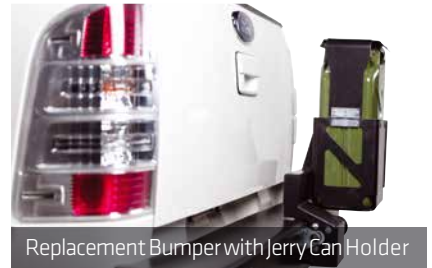
Replacement Bumper with Jerry Can Holder