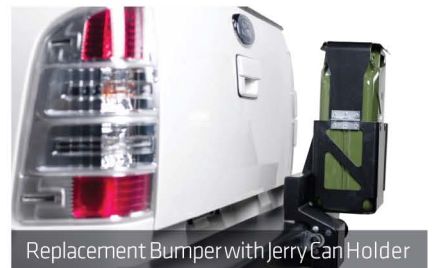
Replacement Bumper with Jerry Can Holder