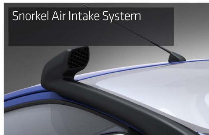
Snorkel Air Intake System