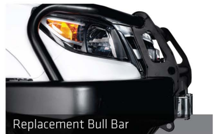
Replacement Bull Bar