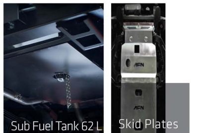
Sub Fuel Tank 62 L Skid Plates