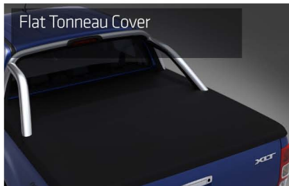
Flat Tonneau Cover