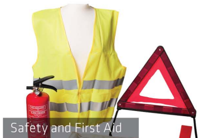
Safety and First Aid