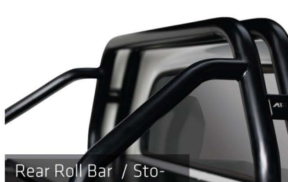
Rear Roll Bar / Sto-