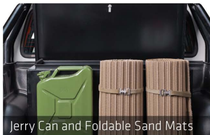
Jerry Can and Foldable Sand Mats